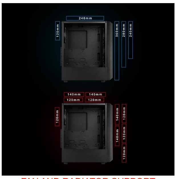
FAN AND RADIATOR SUPPORT