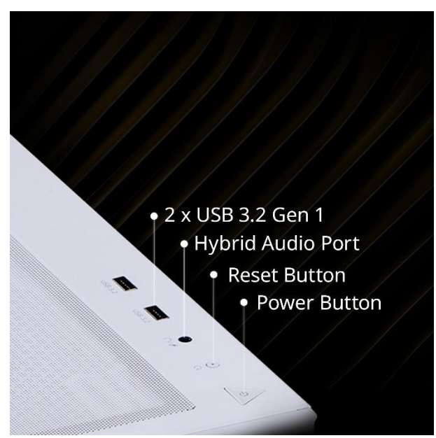
VERSATILE I/O PORTS