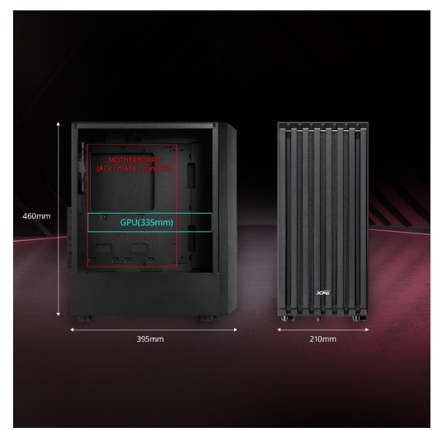
SMALL SIZE, INFINITE OPTIONS