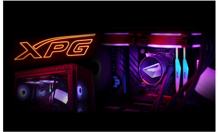
Smooth RGB lighting effect