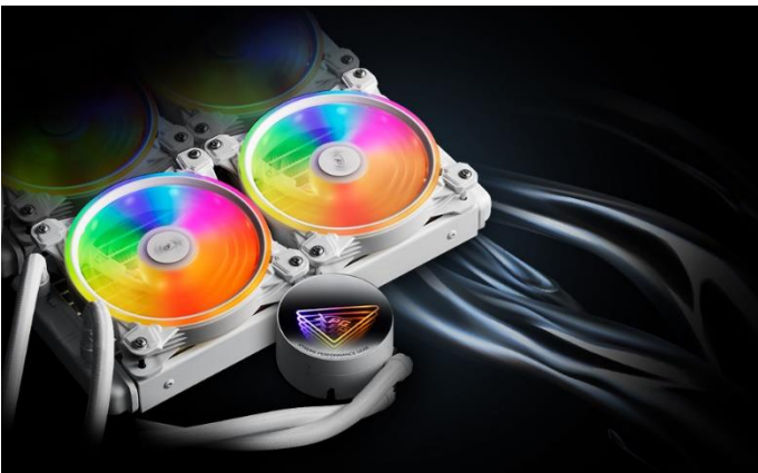
INFINITE MIRROR PUMP DESIGN

An All-In-One CPU Liquid Cooler with industry-leading engineering from Asetek, XPG LEVANTE X provides excellent CPU heat management. This reliable, high performance Liquid Cooling solution ensures smooth system operation for an optimal gameplay experience.