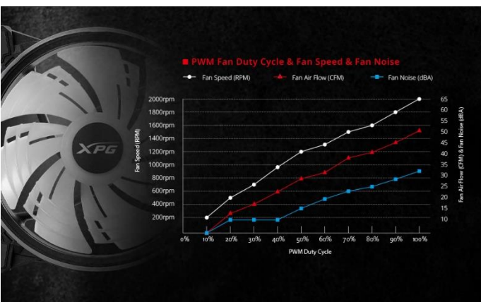
EFFICIENT PWM DESIGN