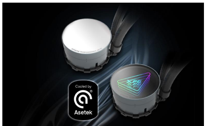
Asetek 7th Gen PATENTED CPU COOLING SOLUTION