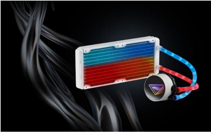
Extreme Performance CPU Cooler