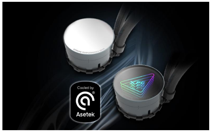
Asetek 7th Gen PATENTED CPU COOLING SOLUTION