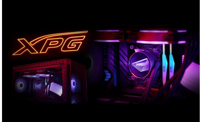
Smooth RGB lighting effect