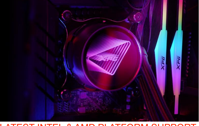
LATEST INTEL & AMD PLATFORM SUPPORT