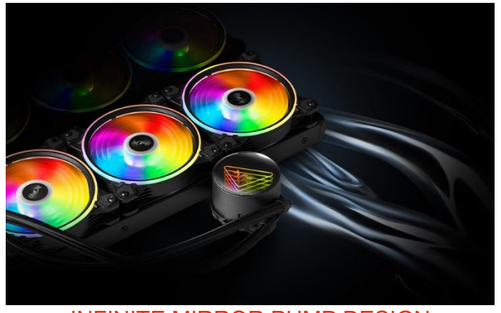
INFINITE MIRROR PUMP DESIGN

An All-In-One CPU Liquid Cooler with industry-leading engineering from Asetek, XPG LEVANTE X provides excellent CPU heat management. This reliable, high performance Liquid Cooling solution ensures smooth system operation for an optimal gameplay experience.