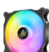
F12 Racing ARGB Single Pack (No Controller)